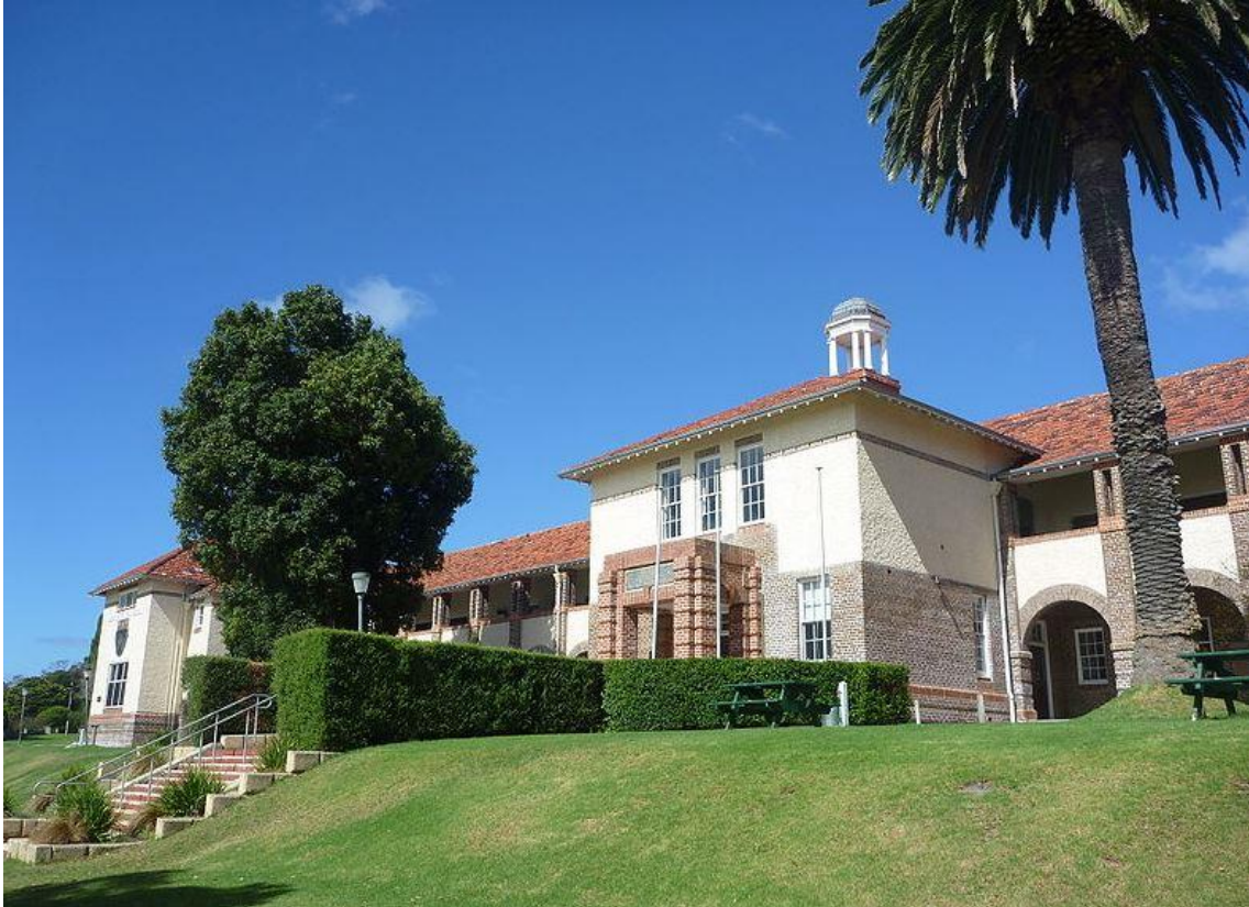
Albany Senior High School