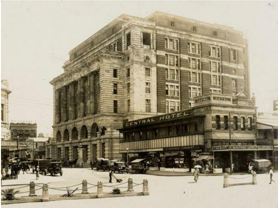
GPO Perth c1929 (Wikipedia)