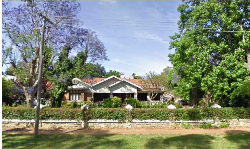
It is likely that 19 Market Street, Guildford is a 1923 example of Duncan's work (Google 2013)