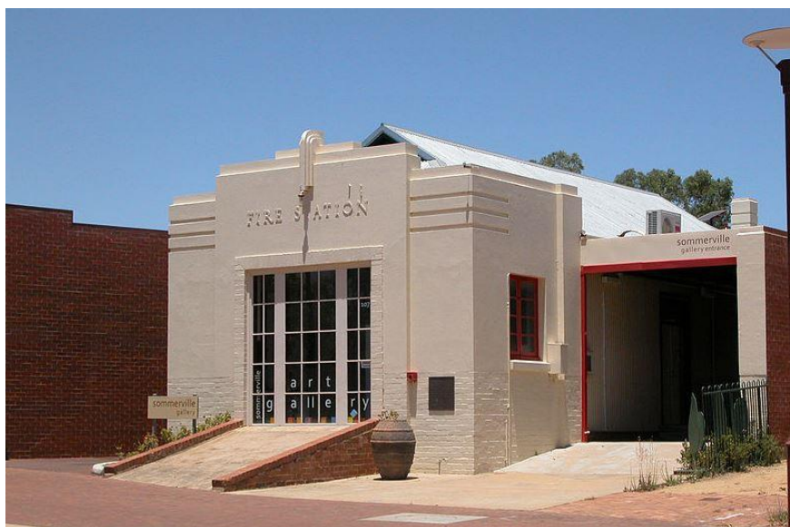
Toodyay Fire Station of 1939.