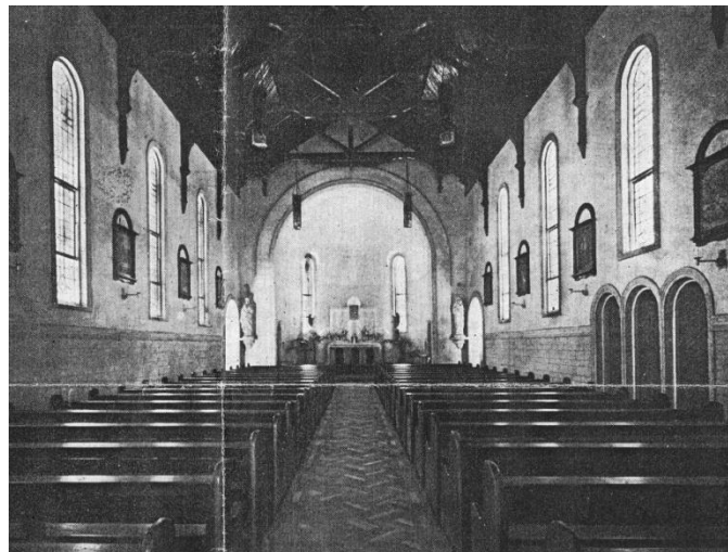
Interior of Clontarf Chapel of 1941 ( The Record , 25 Dec 1941, p.11).