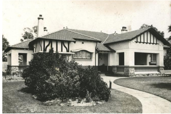
Old York Fire Station of 1897 (Google 2014); Riverina 43 The Esplanade South Perth of 1920 (Richard Mouritzen)