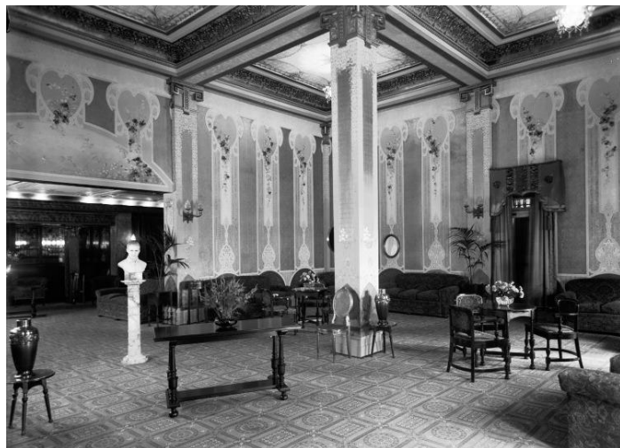
The Capitol Theatre, William Street, Perth in 1931 (SLWA 101412PD, SLWA 101413PD).