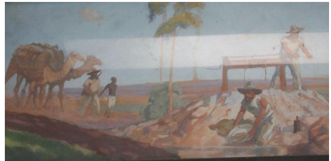
Philip Griffiths Architects 2010