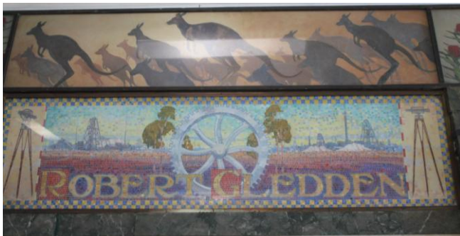
Philip Griffiths Architects 2010