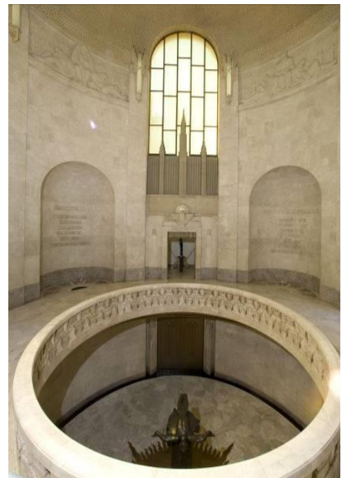
Hall of Remembrance